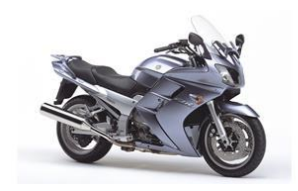
2005 ABS Silver Storm / Bluish Silver 4 (BS4)