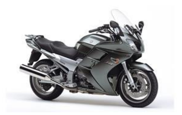
2005 ABS Techno Jade / Dark Bluish Gray Metallic 3 (BNM3)