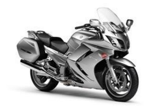
2011 Silver Tech / Silver 3 (S3)