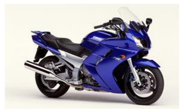
2002 Deep Purplish Blue Metallic (DPBMC)