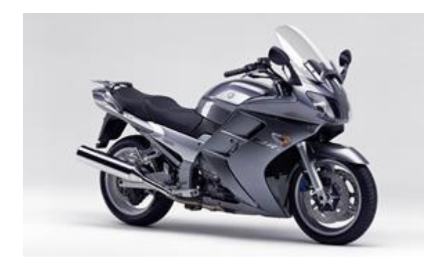
2003 Silver Storm / Bluish Silver 4 (BS4)