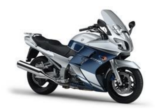
2005 Silver Metallic 1 / Metallic Silver with Rock Slate Blue (SM1)