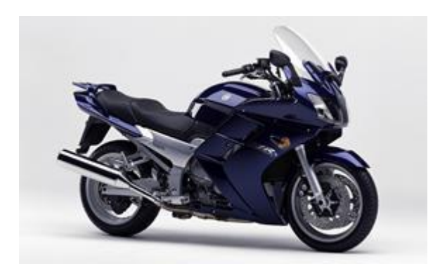
2005 ABS Galaxy Blue / Dark Purplish Blue Metallic L (DPBML)