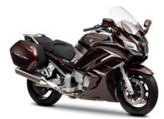
2013 FJR1300A Magnetic Bronze / Very Dark Orange Metallic 1 (VDOM1)