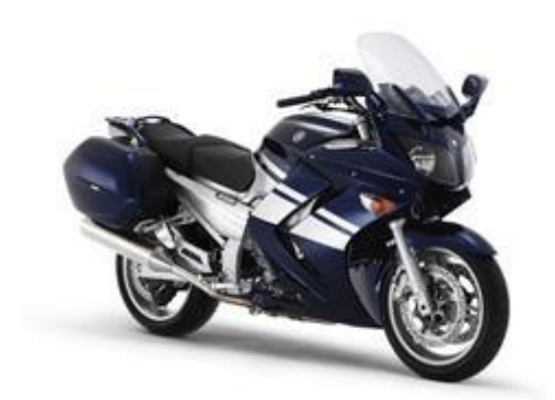
2007 Ocean Depth / Dark Purplish Blue Metallic U (DPBMU)