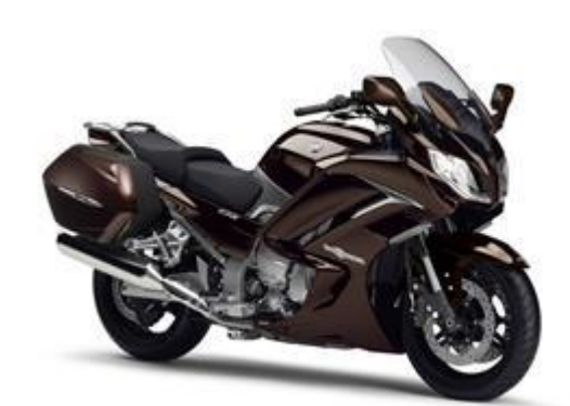
2014 FJR1300A,AE,AS Magnetic Bronze / Very Dark Orange Metallic 1 (VDOM1)