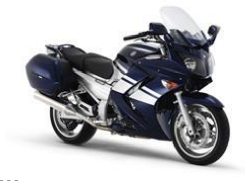
2006 Ocean Depth / Dark Purplish Blue Metallic U (DPBMU)