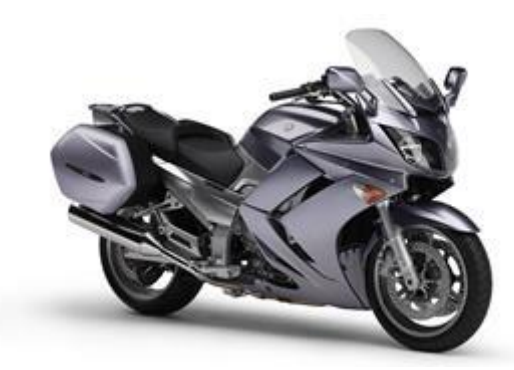
2006 Silver Storm / Bluish Silver 4 (BS4)