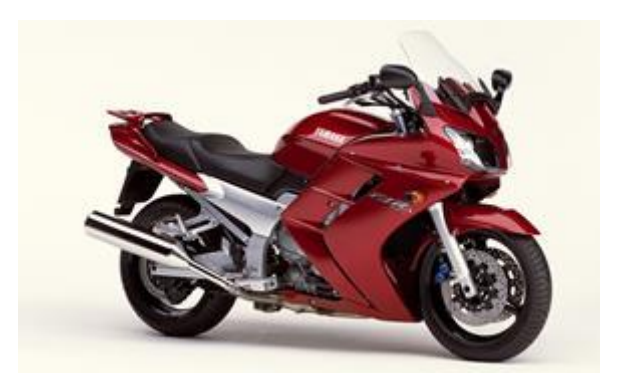
2002 Dull Red Metallic (DRMD)