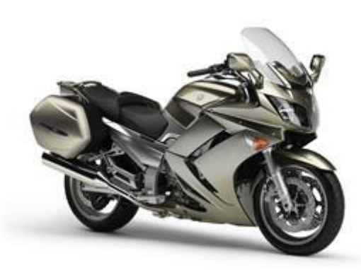
2006 Desert Metallic / Yellowish Gray Metallic 9 (YNM9)