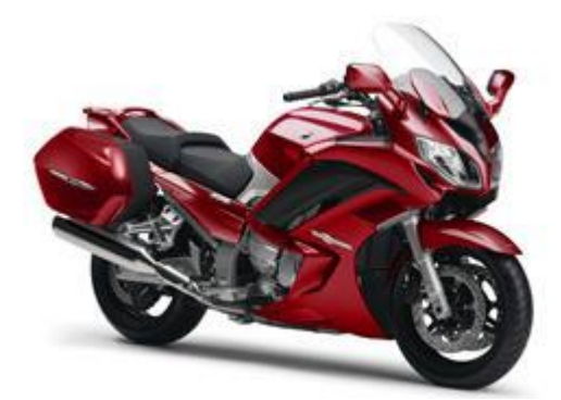
2014 FJR1300A Lava Red / Deep Red Metallic K (DRMK)