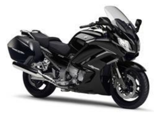
2014 FJR1300 A,AE,AS Midnight Black / Black Metallic X (SMX)

A new model variation is introduced, the FJR1300AE, which sits between the FJR1300A and FJR1300AS in the range. While keeping the standard gearbox system like the A version, it features Yamaha's advanced electronicallyadjustable suspension system, including the upsidedown front fork, like the AS version. By the way, this front fork contains independent damper mechanisms, splitting the compression and damping adjustment between fork legs, for a wider and more accurate range of damping settings. The fact that the rebound and damping functions are split into two distinct operations also means that there is less fluctuation in hydraulic pressure, which in turn helps to ensure stable damping performance, even during hard and sustained use.