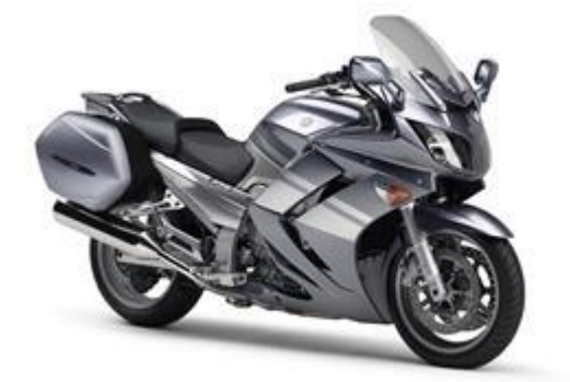
2007 Silver Storm / Bluish Silver 4 (BS4)