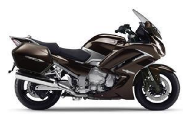
2015 FJR1300 A,AE,AS Magnetic Bronze / Very Dark Orange Metallic 1 (VDOM1)

This year Yamaha offers the same 2 colours for all three variation models A, AE and AS.