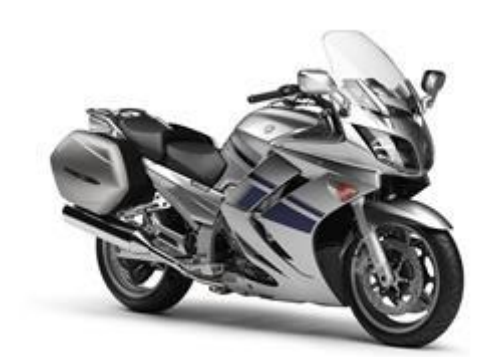
2008 Silver Tech / Silver 3 (S3)