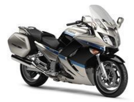
2009 Sunset Silver / Light Yellowish Gray Metallic 9 (LYNM9)