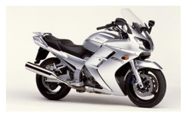
2002 Silver Metallic 1 (SM1)