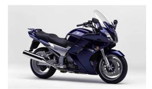
2003 ABS Galaxy Blue / Dark Purplish Blue Metallic L (DPBML)

This year the bike got refinements for fairing and windscreen. The flashers were now integrated in the fairing and a small storage box was added to it. Also the brake system was updated with bigger front disks and the introduction of a version with ABS, the FJR1300A.