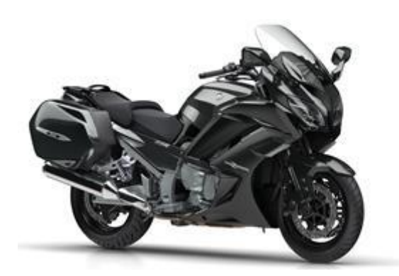
2018 FJR1300 A,AE,AS Tech Graphite / Dark Grey Metallic (DNMN)