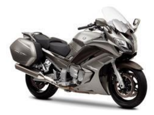
2013 FJR1300A Frosted Blade / Yellowish Gray Metallic 5 (YNM5)