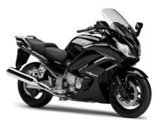
2013 FJR1300AS Midnight Black / Black Metallic X (SMX)

Visually, you can easily tell the difference between the standard (A) version and the AS version because the AS version features an upside-down front fork.