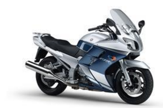
2005 ABS Silver Metallic 1 / Metallic Silver with Rock Slate Blue (SM1)