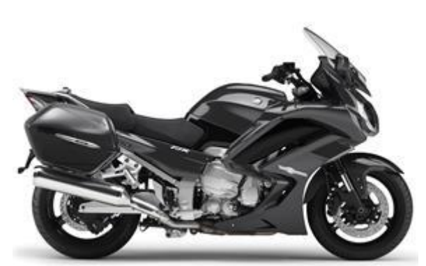
2015 FJR1300 A,AE,AS Tech Graphite / Dark Grey Metallic (DNMN)