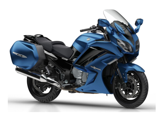
2018 FJR 1300 AE,AS Phantom Blue / Mat Dark Purplish Blue Metallic (MDPBM)