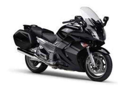
2008 Midnight Black / Black Metallic X (SMX)