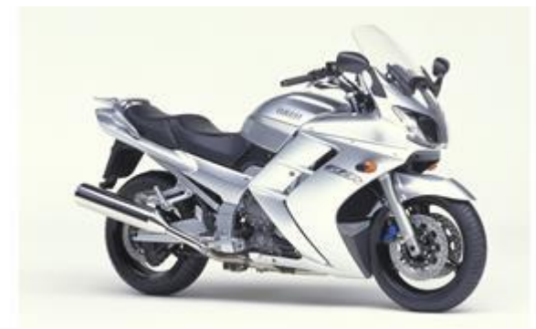
2001 Silver Metallic 1 (SM1)

The FJR focused on being light weight to make the bike easy to use in real life situations. At the same it was developed to be a sporty machine and fun to ride as well. The 145 HP engine and 237 kg dry weight marked a breakthrough in the touring category!