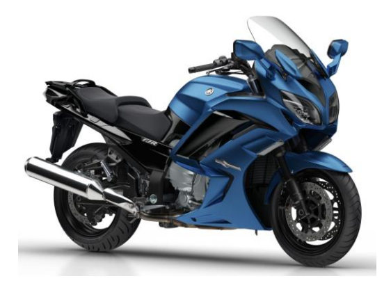
2018 FJR 1300 A Phantom Blue / Mat Dark Purplish Blue Metallic (MDPBM)