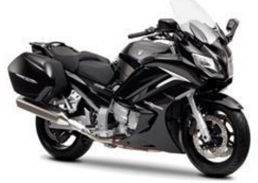
2013 FJR1300A Midnight Black / Black Metallic X (SMX)