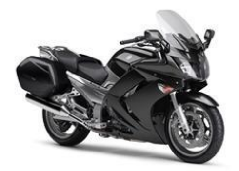
2009 Smokey Grey / Dark Gray Metallic A / Metallic Titanium (DNMA)