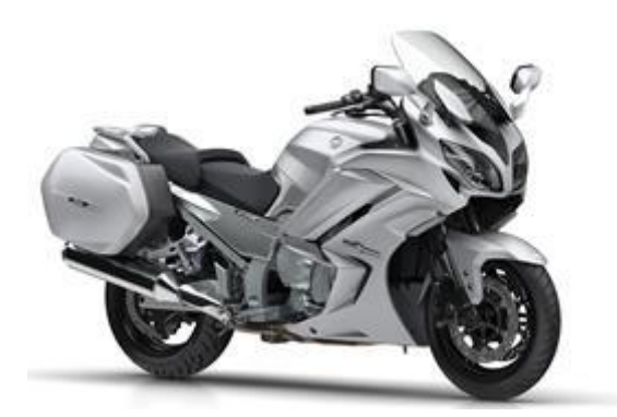
2016 FJR1300 A,AE,AS Matt Silver / Mat Silver #1 (MS1)

FJR1300AS: same as AE version, plus: semiautomatic gearbox with Yamaha chip-controlled shifting, YCC-S.