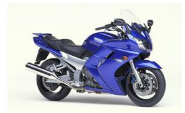
2001 Deep Purplish Blue Metallic (DPBMC)