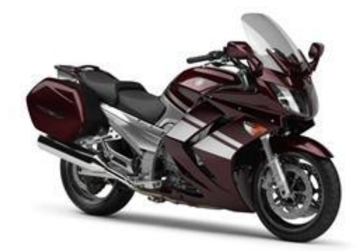
2007 Red Sky / Dark Grayish Red Metallic 3 (DNRM3)