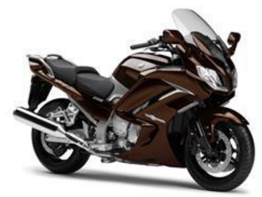
2013 FJR1300AS Magnetic Bronze / Very Dark Orange Metallic 1 (VDOM1)