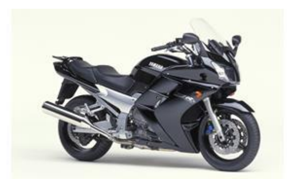
2001 Black 2 (BL2)