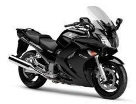
2011 Midnight Black / Black Metallic X (SMX)