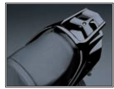
Luggage rack with passenger grab rail

Touring case mounts To facilitate the fitment of optional touring sidecases the FJR's aluminium subframe is fitted with quick-release luggage mounts as standard equipment.