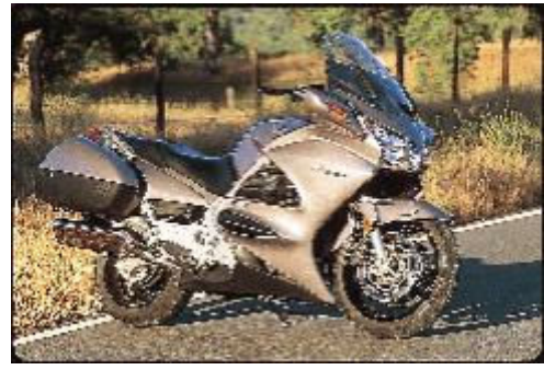
Kevin Wing /Rider Report

Start them up and each four-cylinder engine is a marvel of smoothness and power. Out on the road the Yamaha feels aggressive, like a big-inch supersport that grew a fairing and bags. The Honda, by contrast, seems designed from the beginning as a sport tourer. Its pleasing mechanical purr becomes a snarl in the upper rpm ranges. While the Yamaha peaks at 124.5 rear-wheel horsepower at 7,850 rpm and puts out 90.1 pounds-feet of torque at 6,700, the Honda cranks out 111.3 peak rear-wheel horsepower at 7,700 rpm, and makes 83.6 pounds-feet of torque at 6,100 rpm. Both have steep horsepower graph lines and hugely broad powerbands,