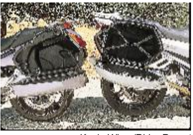
Kevin Wing /Rider Report

The latter is partly because of the Honda's linked braking system; using either the front lever or the rear pedal activates the stoppers at both ends. Through a proportional control valve, the majority of braking force is delivered to whichever brake was actuated with more force. A delay valve in the fork slows initial braking response to minimize fork dive, and it all works very well.